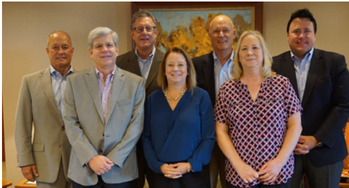
The 2019 ECU Advisory Board Members

ECU appreciates these volunteers for their participation and valuable contributions!