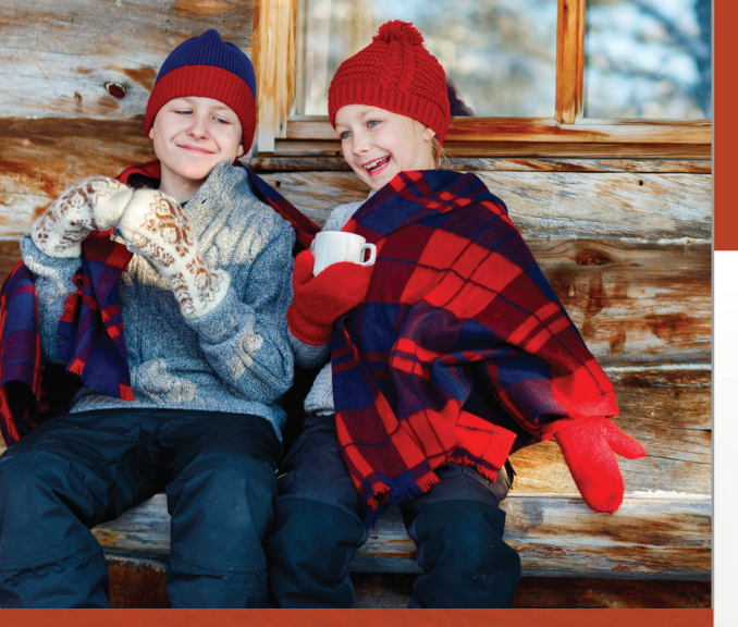
Newsletter for Members • February 28, 2025